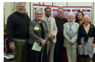
Speakers for 'God or No God...'

'Excellent speakers giving their differing ideas, was thought-provoking.'